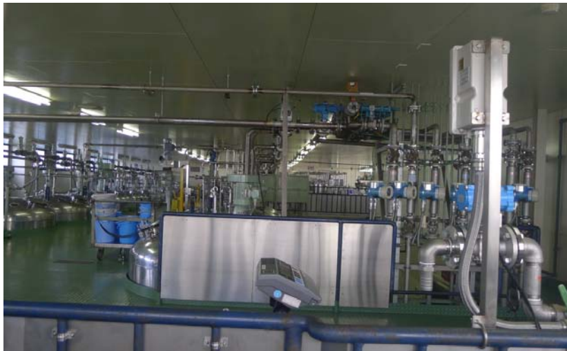
Figure 2 The production facilities of the Kanebo factory

This experiment made me know that the production of cosmetics is very strict, because it has to consider its effects, sanitary and packing. A product before sales has to be tested by subject tests and object tests. Different climates make different skin influences, so researchers have to find different cosmetic formulas for different areas. How a complicated work is !